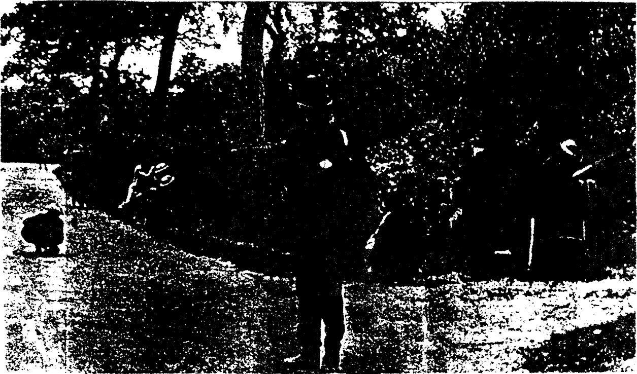
Borough Farm 24 July 1940