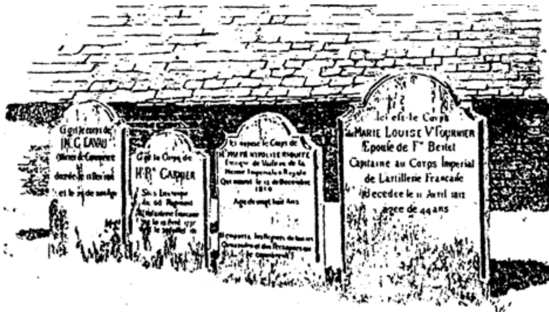
French prisoners gravestones History of Alresford - A J Robertson

Although the combined French and Spanish fleets were largely destroyed at the Battle of Trafalgar in 1805 the possibility of invasion was still taken seriously. In 1810 the threat was regarded as sufficiently serious for many prisoners to be transferred from the vulnerable south of England to Scotland. Napoleon abdicated in 1814 and was finally defeated at Waterloo in 1815 and all prisoners were soon repatriated.